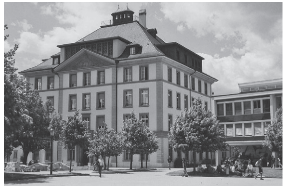
Fig. 3. The Lyceum of the Collège Saint-Michel, Fribourg. View of exterior, 2004.