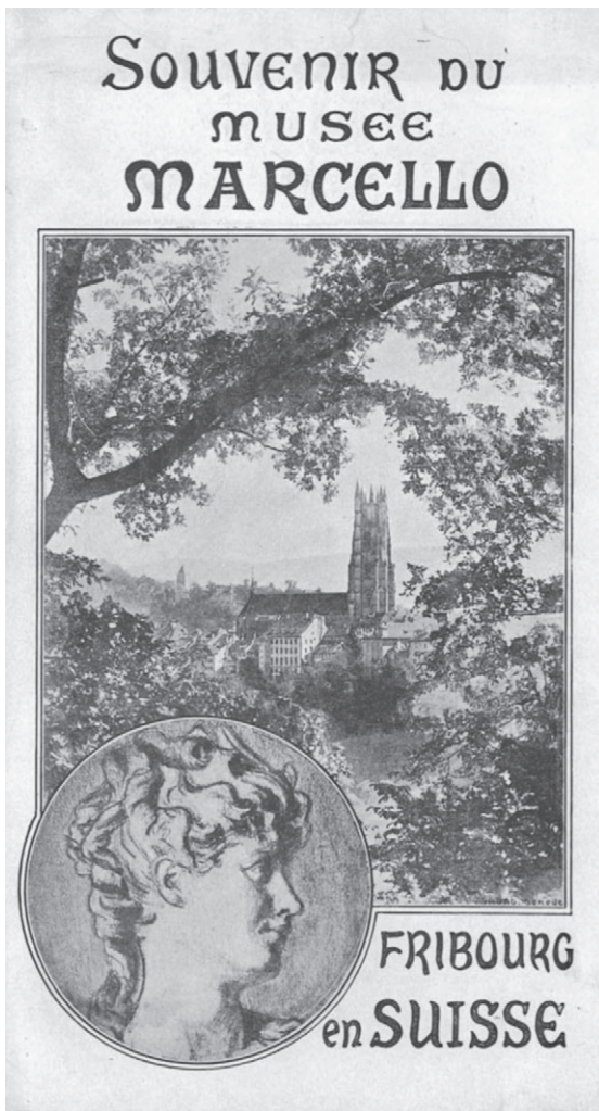
Fig. 6. Sadag. Front cover illustration for Souvenir du Musée Marcello, Fribourg en Suisse (Fribourg, 1905).

among those which devote the most money to paintings and statuary, envy the fate of the city of Marcello's birth, which finds itself thus the possessor of one of the most beautiful collections in Switzerland, while so many others collect them with great effort of patience, cost and difficulty.