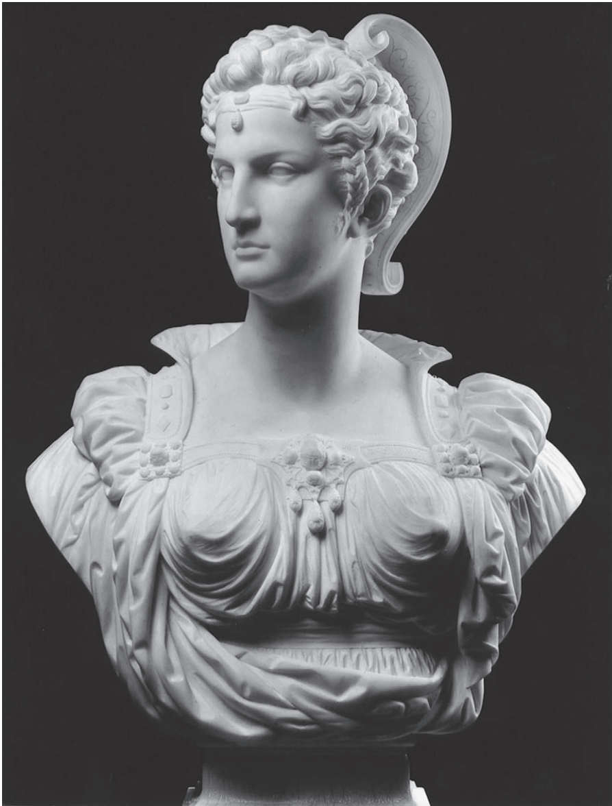
Fig. 7. Marcello, Bianca Capello , 1863 (this carving in marble, after 1879). Musée d'Art et d'Histoire, Fribourg [M 1]. Fribourg Museum, this work is exhibited at the Museum.

Greyerz devoted much of her forty-five-page text to a biography of Marcello and a historical discussion of her oeuvre, and she wrote little about the other artists whose works were included in the collection. Yet her description of the Musée Marcello, displayed within, and as part of, the Cantonal Museum, is instructive with regard to the odd nature of their juxtaposition. The confrontation with craft and historical