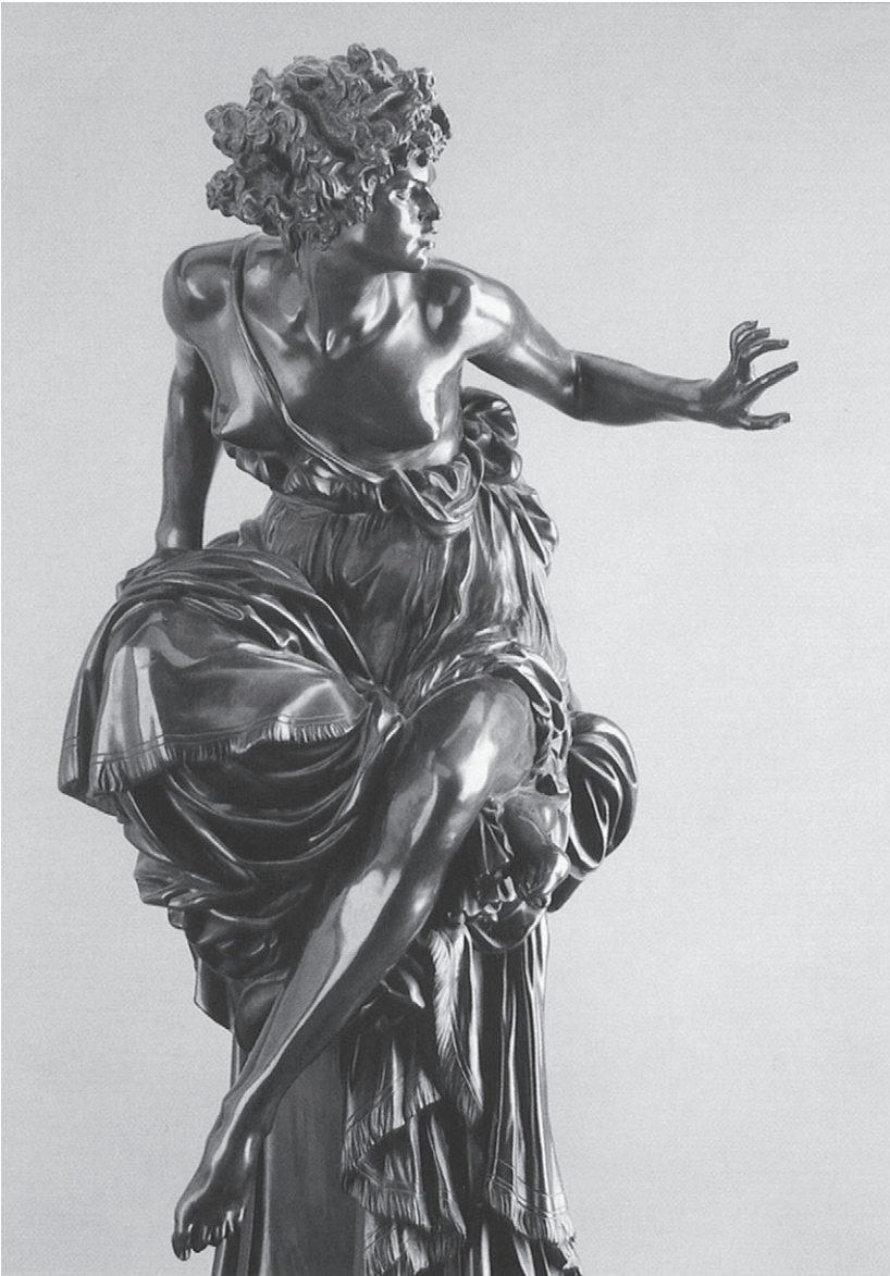
Fig. 2. Marcello, Pythia , 1870 (this cast, after 1879). Bronze. Musée d'Art et d'Histoire, Fribourg. [M 15]. Fribourg Museum, this work is exhibited at the Museum.

The process of how specific pieces were selected for the museum remains a mystery. The only work of art explicitly mentioned in the testament to be destined for the museum was her painted portrait by Édouard Blanchard, originally shown in the Paris Salon of 1877 (see Fig. 1). Even with regard to her own sculptures, Marcello's testament stipulates only that some of the money bequeathed to the canton be used for the reproduction in bronze and marble of some of her 'principal works', those being the sculptures for which she received acclaim in Paris during