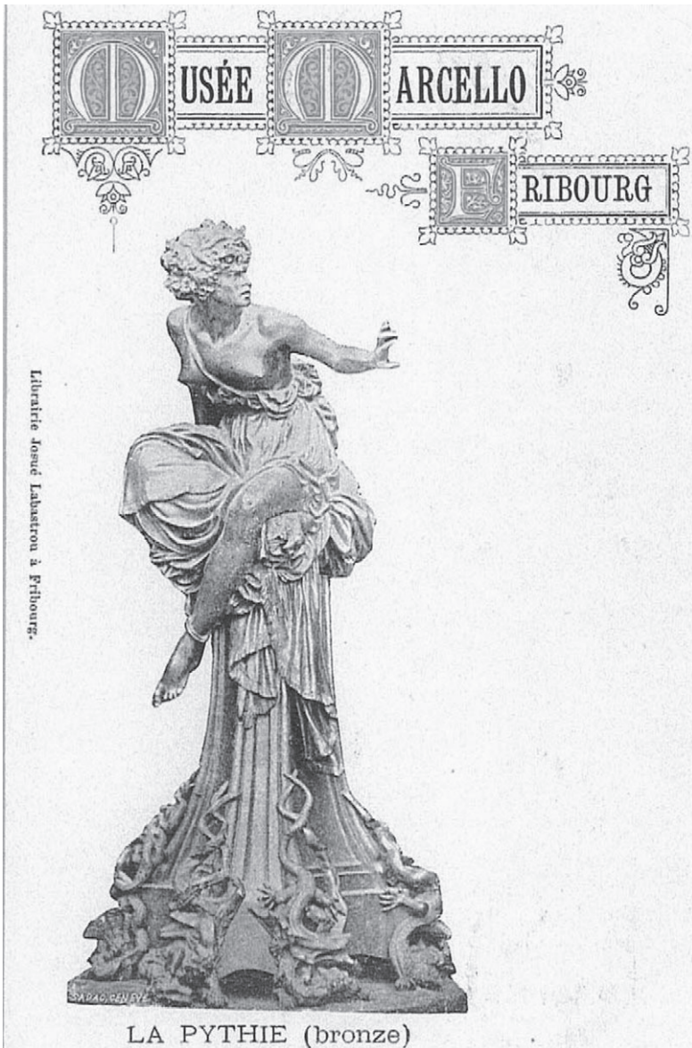
Fig. 5. Librairie Josué Labastrou, Fribourg. Publicity postcard for the Musée Marcello, showing the Pythia , not dated (after 1881).

sister of the painter, visited the Musée Marcello in 1904, admired her brother's portrait of Marcello that was displayed there (now at the Musée des Beaux-Arts, Reims) and was impressed by the collection given to Fribourg by her brother's great friend. 12