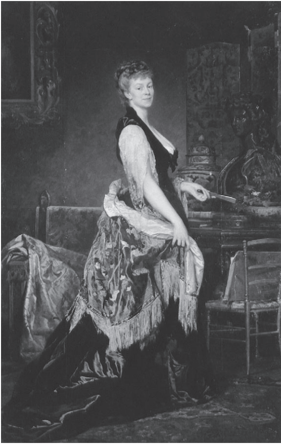
Fig. 1. Édouard Blanchard, Portrait of the Duchess Castiglione Colonna , 1877. Oil on canvas. Musée d'Art et d'Histoire, Fribourg [M 61]. Fribourg Museum, this work is exhibited at the Museum.

the contemporaneous literature published regarding the museum at the time immediately following its establishment has yet to be analyzed. 2 Additionally, the twentieth-century attempts to reconstruct the museum in order to conform to the artist's original wishes have yet to be chronicled. This essay provides the first historical account of the original Musée Marcello, based on the observations of the original organizers, curators involved in its formation, and art critics. Archival materials relating to the attempts to restore Marcello's original intentions play an additional historical role in the posthumous life of this vanished museum.