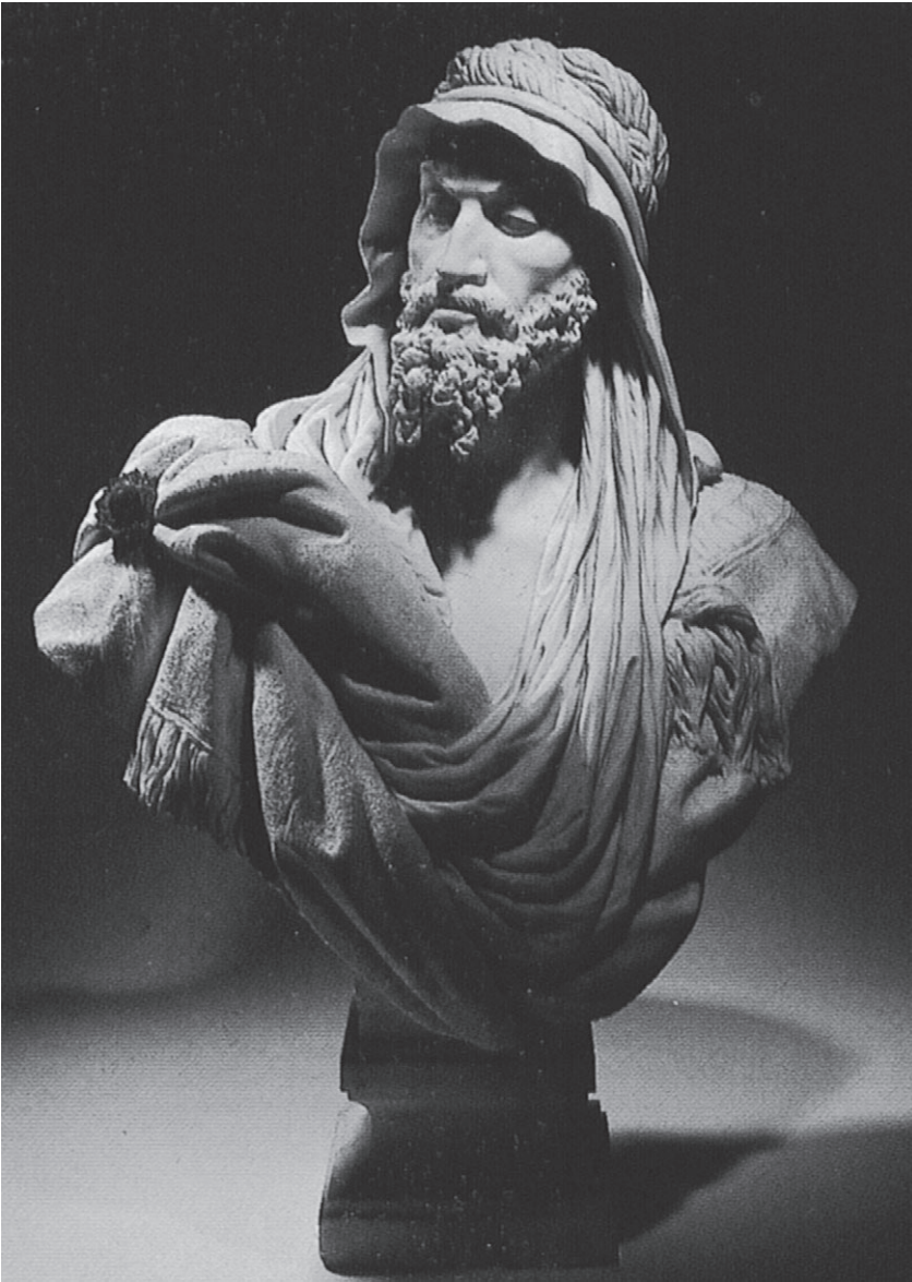
Fig. 8. Marcello, Abyssinian Chieftain, 1870. Marble, bronze and lapis lazuli. Musée d'Orsay, Paris [RF 3685].

change of aesthetic taste on the part of museum officials. By the late 1920s and 1930s, so much had changed within Europe's cultural landscape. Next to paintings by Pablo Picasso, films by Fritz Lang, the work of Walter Gropius and the Bauhaus, and to new movements in art by living Swiss artists such as Le Corbusier, Alberto Giacometti, Paul Klee and the Zurich Dada group, Marcello's sculptures and the works of her academically trained friends must